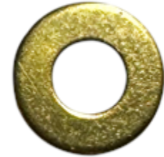
#10 Flat Cut Washers, Brass, Jar

UPC: 08593704675 Country of Origin: TAIWAN UNSPSC: 31161807 Commodity: Flat washers