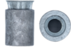
5/16"-18 Lead Machine Screw Anchors, Jar

UPC: 08593700265 Country of Origin: CHINA UNSPSC: 31162101 Commodity: Concrete anchors